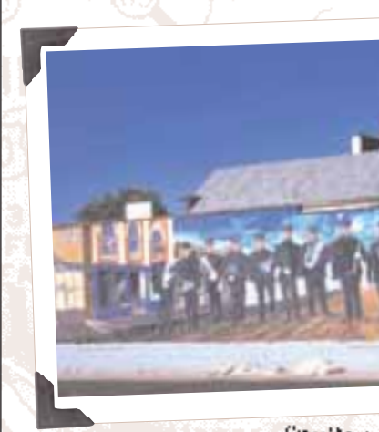
Schoolhouse mural, west wall of New Street Boutique