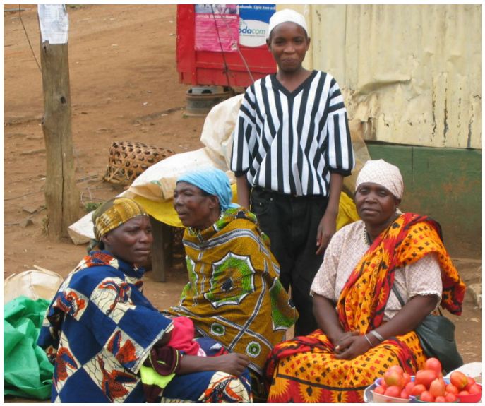
Lushoto, Tanzania/November 4, 2005

With Howard's help, a board trip was planned focusing on relatively stable countries poised for growth and economic development. South Africa was ruled out, seen as too far along to have significant impact with a small investment, but a number of possibilities remained. Eventually, there