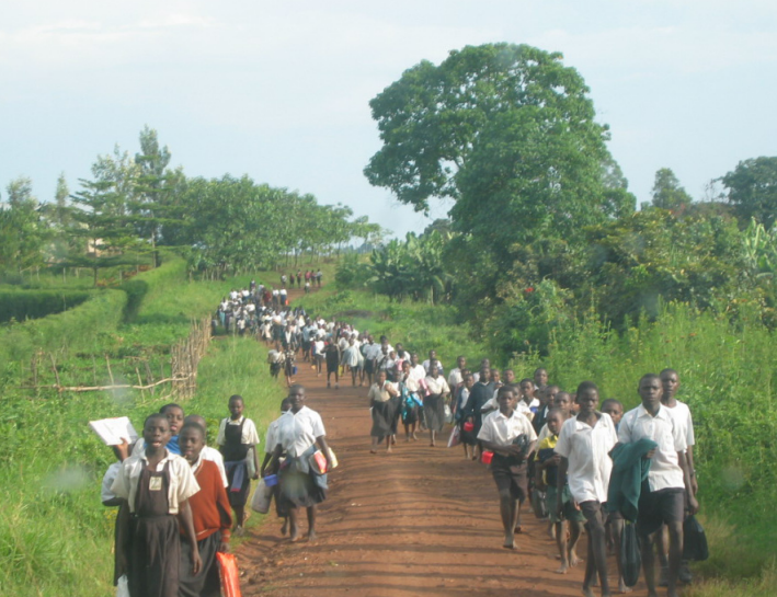
Fort Portal Area, Uganda/November 9-11, 2005