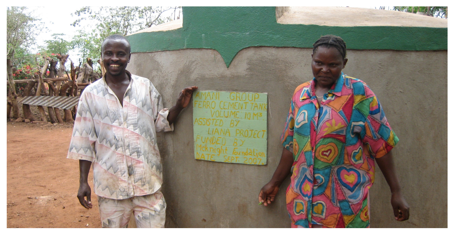
Moshi, Tanzania/February 11, 2008

the [grantee] program directors and their aspirations." She continued, "I witnessed how McKnight's money could make a difference not just programmatically but institutionally technical assistance, capacity building, program evaluations creating an infrastructure that didn't [previously] exist."