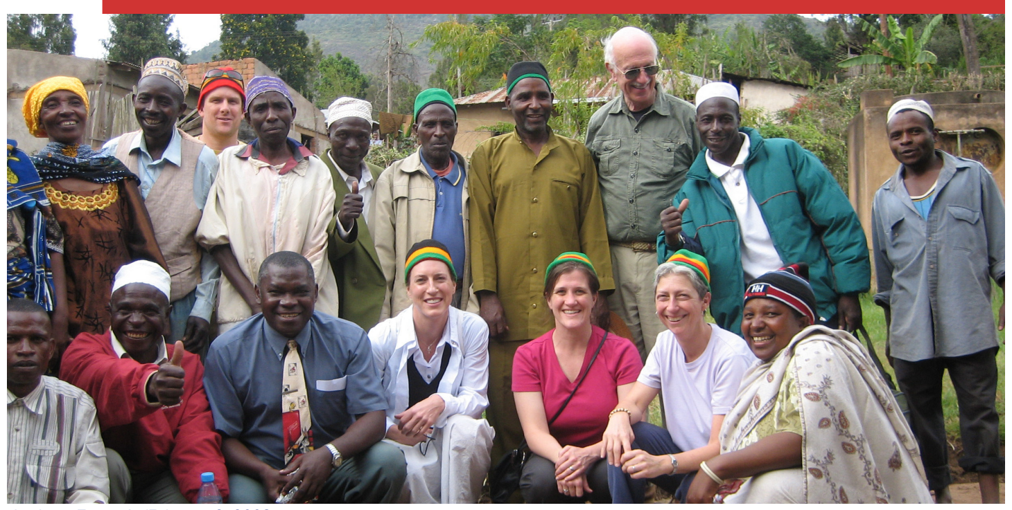
Lushoto, Tanzania/February 9, 2008

The report that follows is intended to serve as part of the "institutional memory" of The McKnight Foundation's East Africa Women's Economic Empowerment program. Its heavy reliance on individual recollections may detract from its precision, but such reflections provide a vivid and inspiring understanding of the Foundation's compassion, commitment, and impact on the people and communities of Tanzania, Uganda, and Zimbabwe.