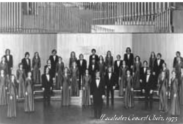
Macalester Concert Choir, 1975