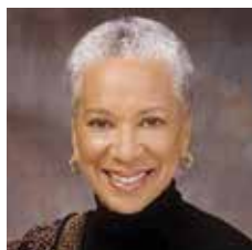
ANGELA GLOVER BLACKWELL