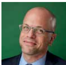
XAVIER DE SOUZA BRIGGS