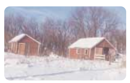
Bly's old study (once a chicken house)