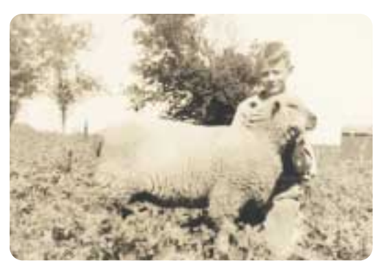
As a child in Madison, Minnesota

Awarded Fulbright Fellowship to Norway, where he discovers the work of South American and Spanish poets and decides to introduce them in English translation through a new literary magazine.