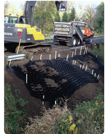
Flooding in 2012 in Northeast Minnesota damaged roads and bridges, water and sewer systems and other infrastructure, costing $108 million. More than 1,700 homes and 100 businesses were damaged or destroyed, costing more than $12 million.