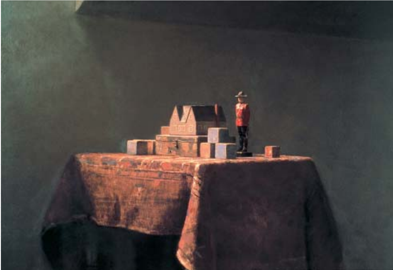
Mountie 1980 oil on canvas 36 x 48 inches