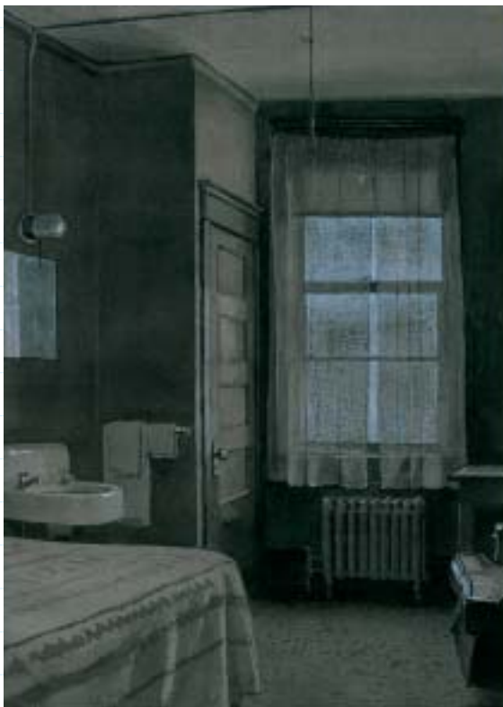
Room 431 1995 ink, Chinese white 14 x 10 inches

lamppost playing across the rounded shapes of a gigantic grain elevator; or—my favorite—a solitary street lamp against a pitch black sky illuminating the side view of a saloon, with a car and a couple of pickups parked outside in the snow. This, to me, is so evocative that I can picture again the dozens of similar taverns I used to drive past during my years in northern Minnesota. The bleak light, the frost on the vehicles, and the smoke rising from the chimney tell me that it's a very cold night. This, like most of his work, contains no human figures, and yet you can imagine the human presences inside the building.