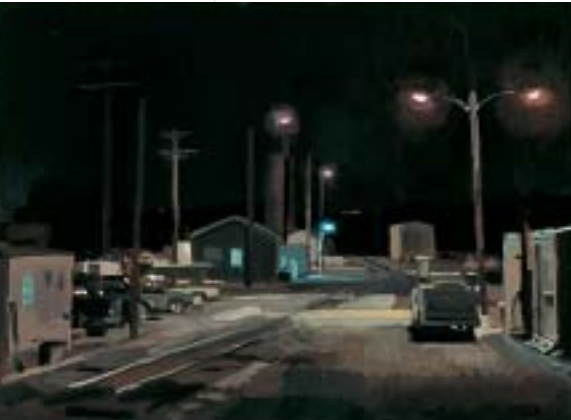
Rail Yard Nocturne 1992 oil on panel 16 x 22 inches

Mike's work sneaks up on you. The stillness of his paintings and drawings is rich; the grayness is clear. The silence of his urbanscapes breathes. You begin to feel Mike's darkness and mystery before you see it, like the drumming of a grouse.