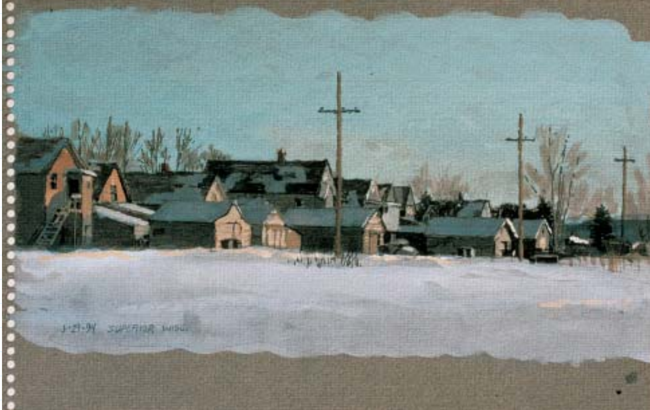
Houses, Superior West 1994 ink and gouache on gray paper 5 1/2 x 9 inches

Opposite: Gold Medal Looking Southeast 1996 ink, watercolor, and gouache on paper 11 x 8 1/2 inches