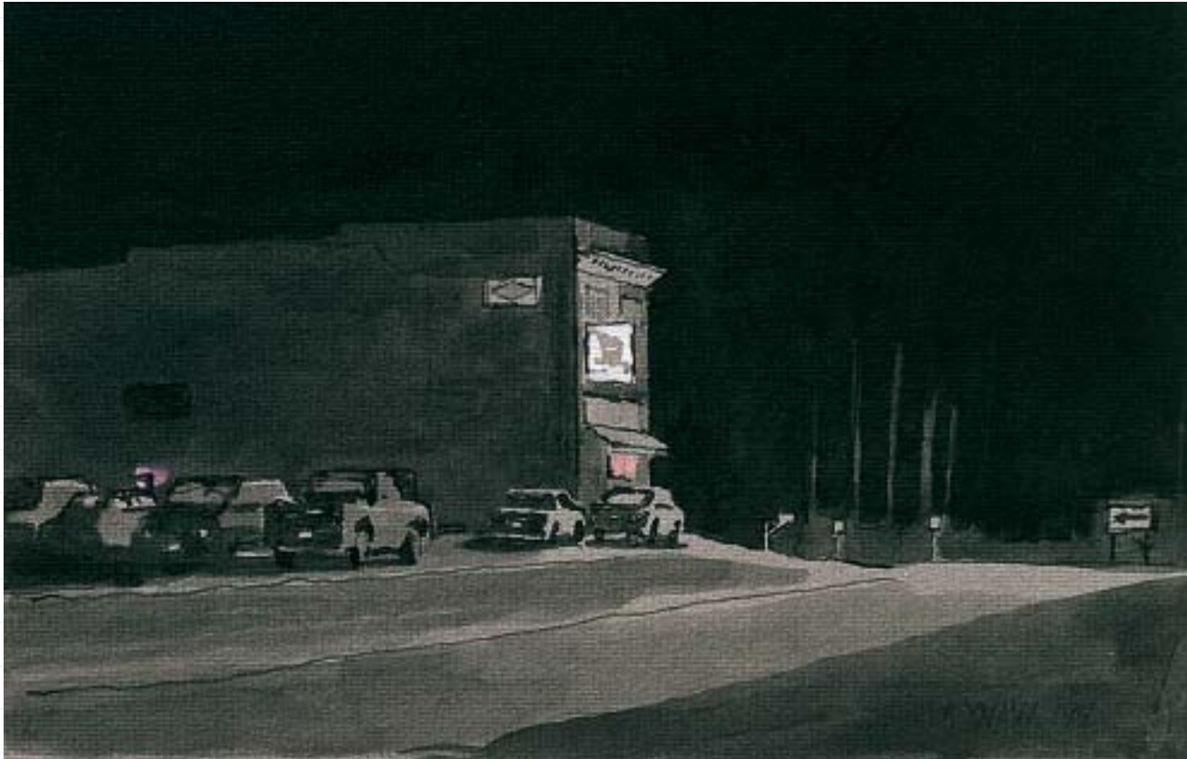
Saturday Night at the Palace 1994 ink and watercolor on gray paper 5 1/2 x 9 inches