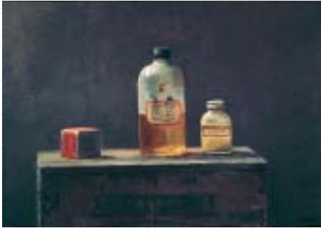
Painting Media 1980 oil on panel 16 x 20 inches