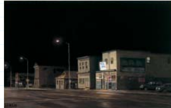
Smitty's Bar 1992 oil on panel 13½ x 22 inches

Greg Brown Singer-Songwriter Hacklebarney, Iowa