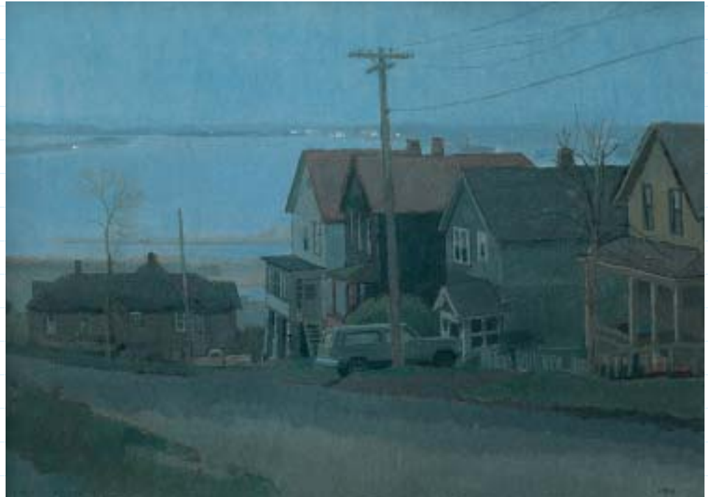
Harbor Lights 1983 oil on panel 16 x 22 inches