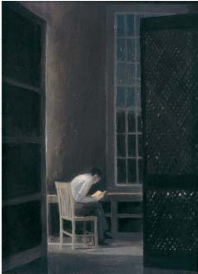
Pop at the Mine 1958 oil on canvas 16 x 12 inches