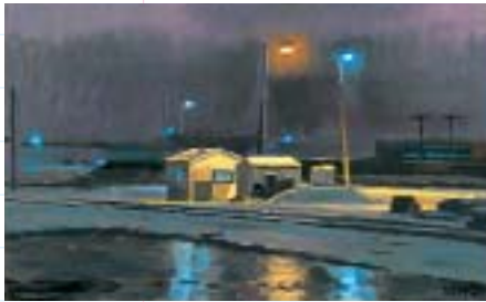
Yard Shanty 1994 oil on panel 12 x 18 inches

Lynch's paintings are saturated with melancholy—even his nature scenes feel restrained and lonely. He notes laconically that “trees are hard to paint with all those leaves” and says he prefers to depict them at night when they become solid masses of shadow. But for this master painter, the resistance to conventional beauty is