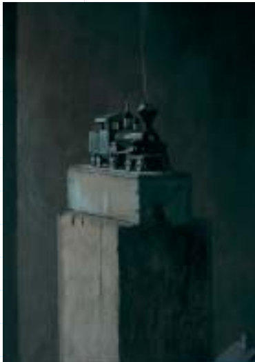
Locomotive 1983 oil on panel 22 x 16 inches