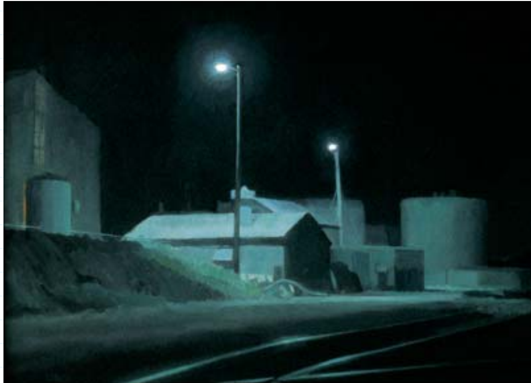
Marine Oil Company 1985 oil on panel 16 x 22 inches

“I’m more interested in architecture that has accumulated over time, rather than being designed. I like things that have just happened, that are weathered, added on.”